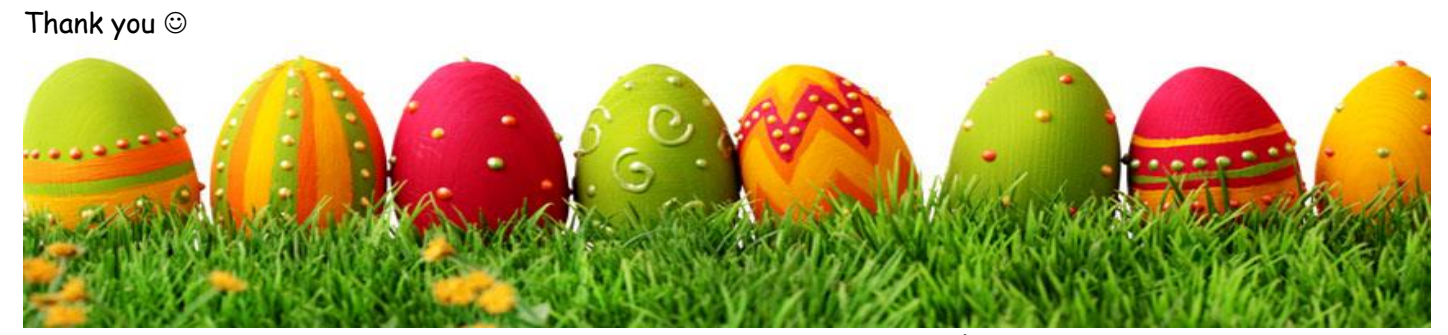
Easter Eggstravaganza on Monday 26th March

In the meantime the inspector asked me to pass on his thanks to the number of parents who completed Parent View, to the children, who he described as 'consistently delightful' and to the staff and governors for their warm welcome and commitment to the children of TRJS.