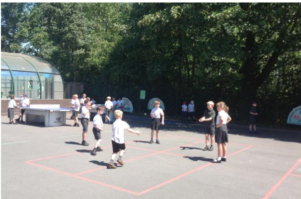
Learning the TRJS famous 'Boxes' game.

some new faces and beginning to learn some new routines. We are super proud of TRJS Years 3, 4, and 5 who were excellent role models throughout the day and the photos show just a snapshot of fun, sunny playtimes.