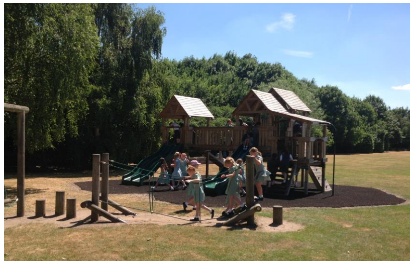
Facing the challenge of the Adventure playground.

Enjoying a game of chess in the sunshine.