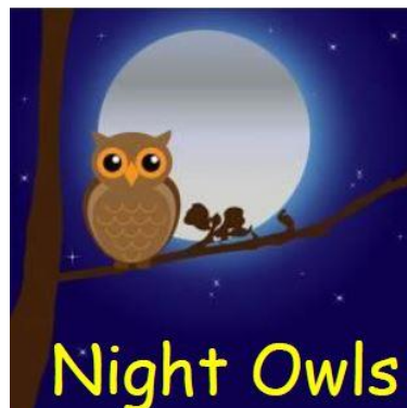
After School Club - PT3FG