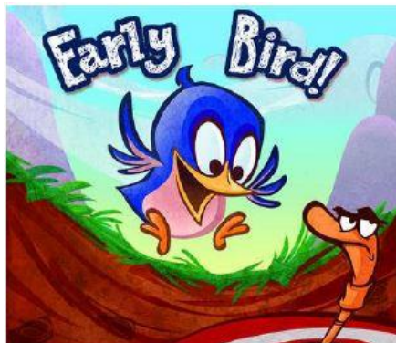
Breakfast Club - 3PEQW