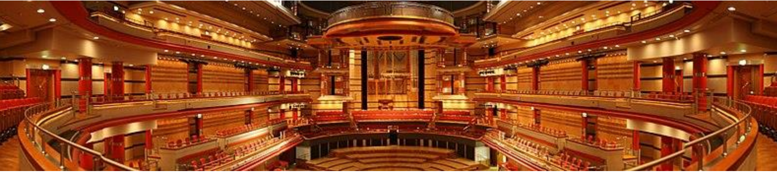
Inside Birmingham Symphony Hall!

We were incredibly proud to be invited with our Choir to perform this week at Birmingham Symphony Hall. A group of 40 children were selected, in our toughest auditions yet, and have worked tirelessly over the last six weeks (giving up break times, lunchtimes and working hard at home) to learn seven new songs which we were to sing as part of a massed choir.