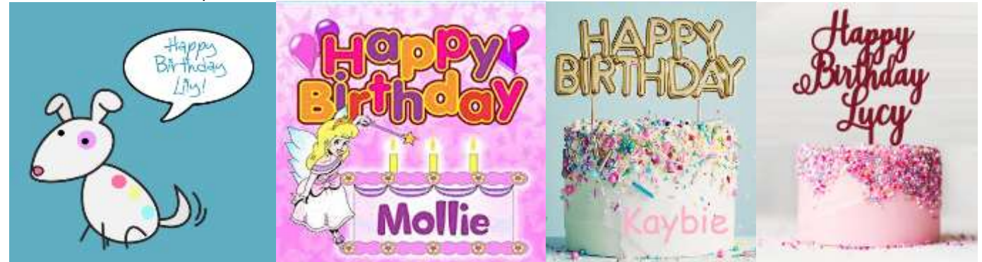
We hope you all have a fabulous day \ensuremath{\textcircled{}^{\odot}} Keep calm and eat cake!