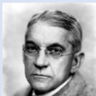
William Lyon Phelps