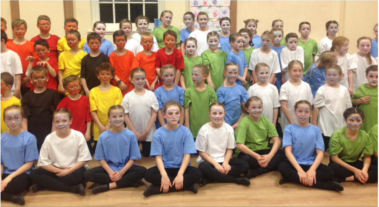
Thomas Russell Junior School Choir visit to the Lichfield Garrick

On Tuesday 22 nd March, Thomas Russell Junior School choir went to perform in a concert at the Lichfield Garrick, which was run by the Lichfield Rotary Club. They sang five impeccable songs including: Power in Me; I See the Light (Tangled); The Lightning Tree; Circle of Life (Lion King); and Colours of the Wind (Pocahontas). They had the power to be the talk of the town with their outstanding singing!