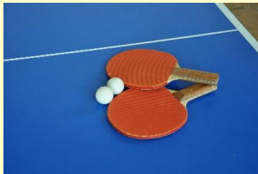
Table Tennis – starting soon